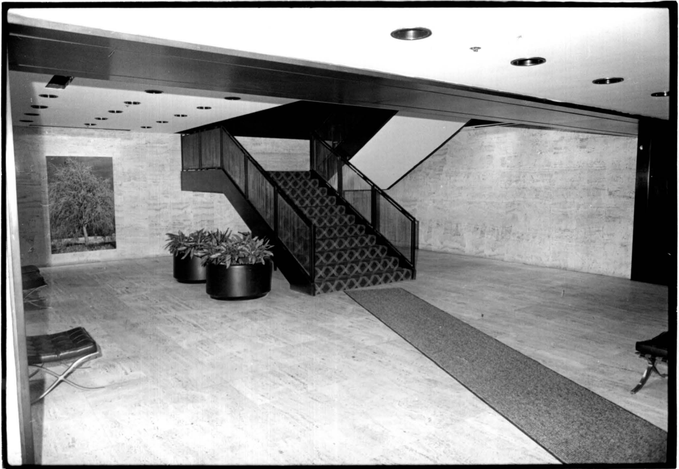
FOUR SEASONS RESTAURANT East 52nd Street Lobby GROUND FLOOR INTERIOR