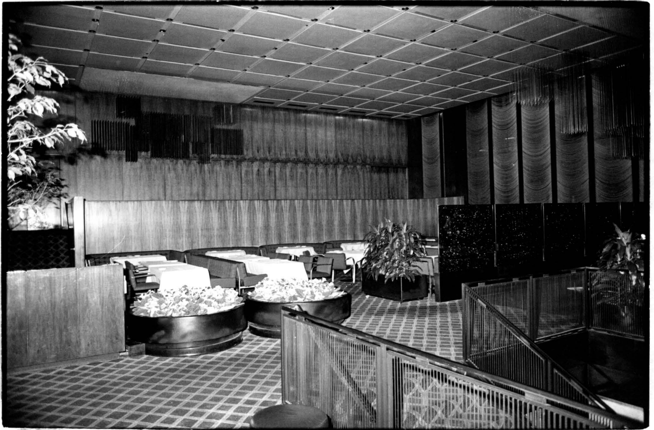
FOUR SEASONS RESTAURANT Bar/Grill Room FIRST FLOOR INTERIOR