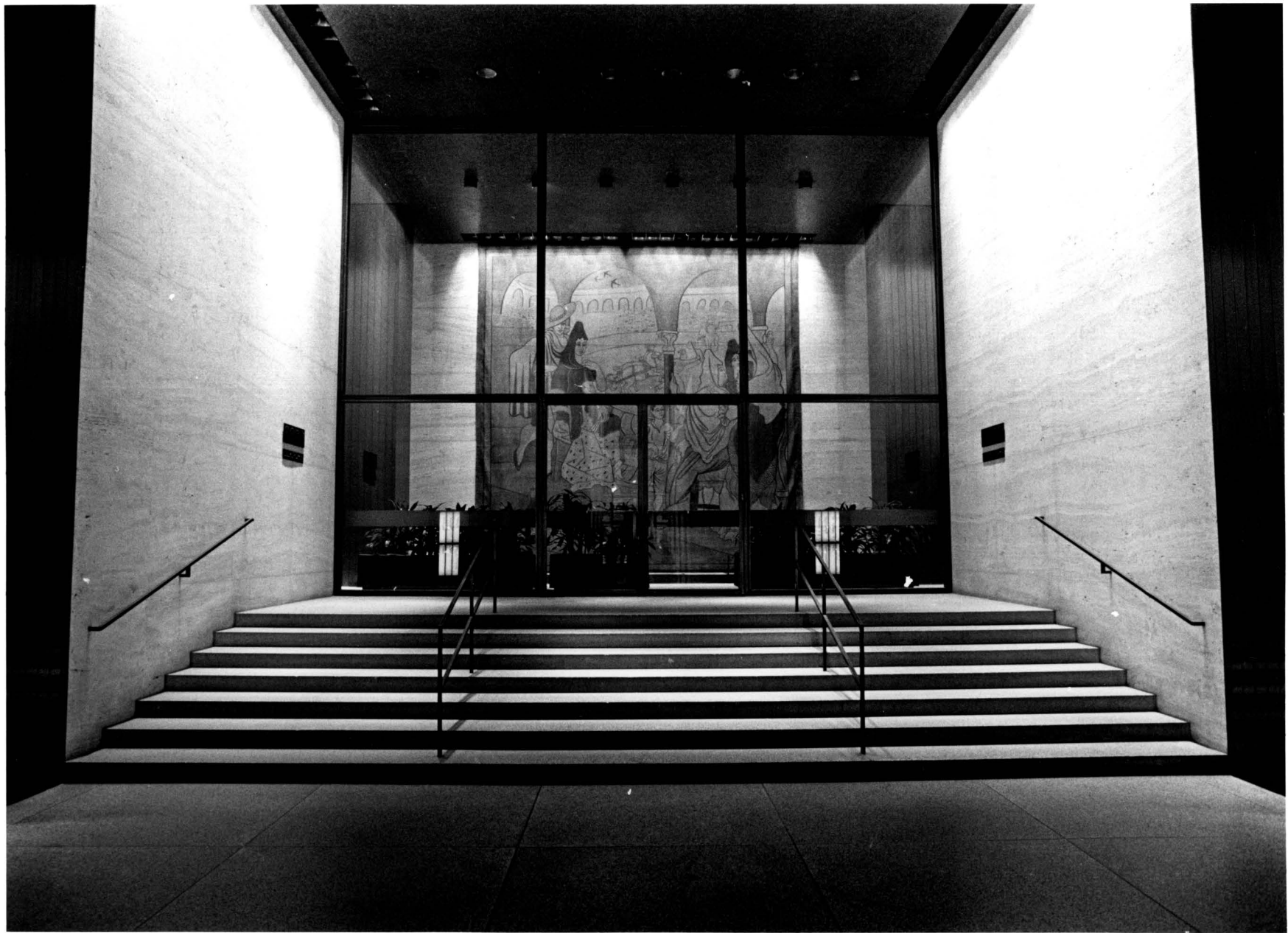
FOUR SEASONS RESTAURANT View of Lobby from Seagram Building Lobby FIRST FLOOR INTERIOR