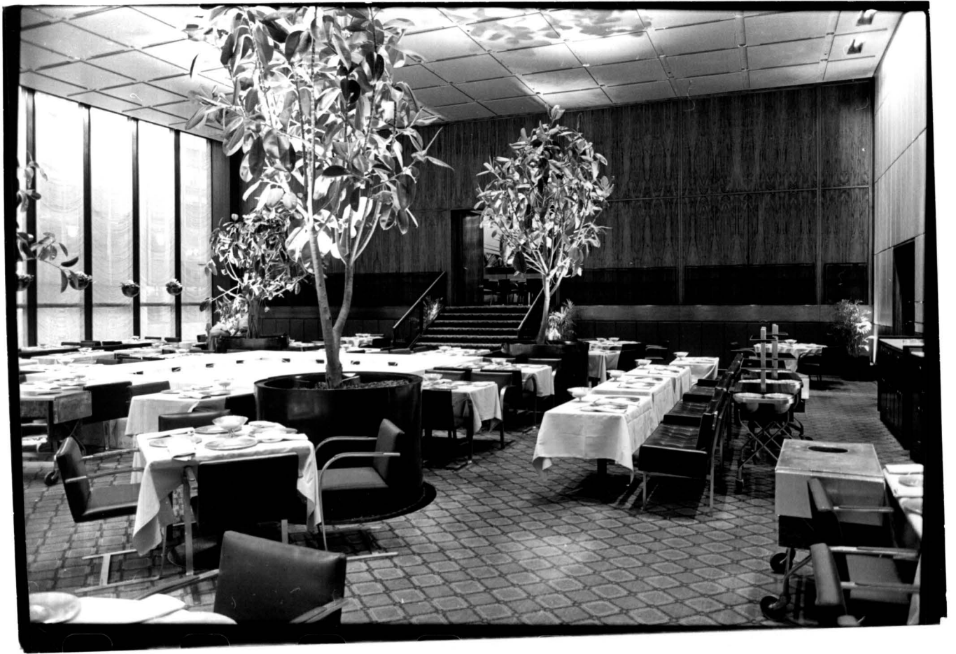
FOUR SEASONS RESTAURANT FIRST FLOOR INTERIOR