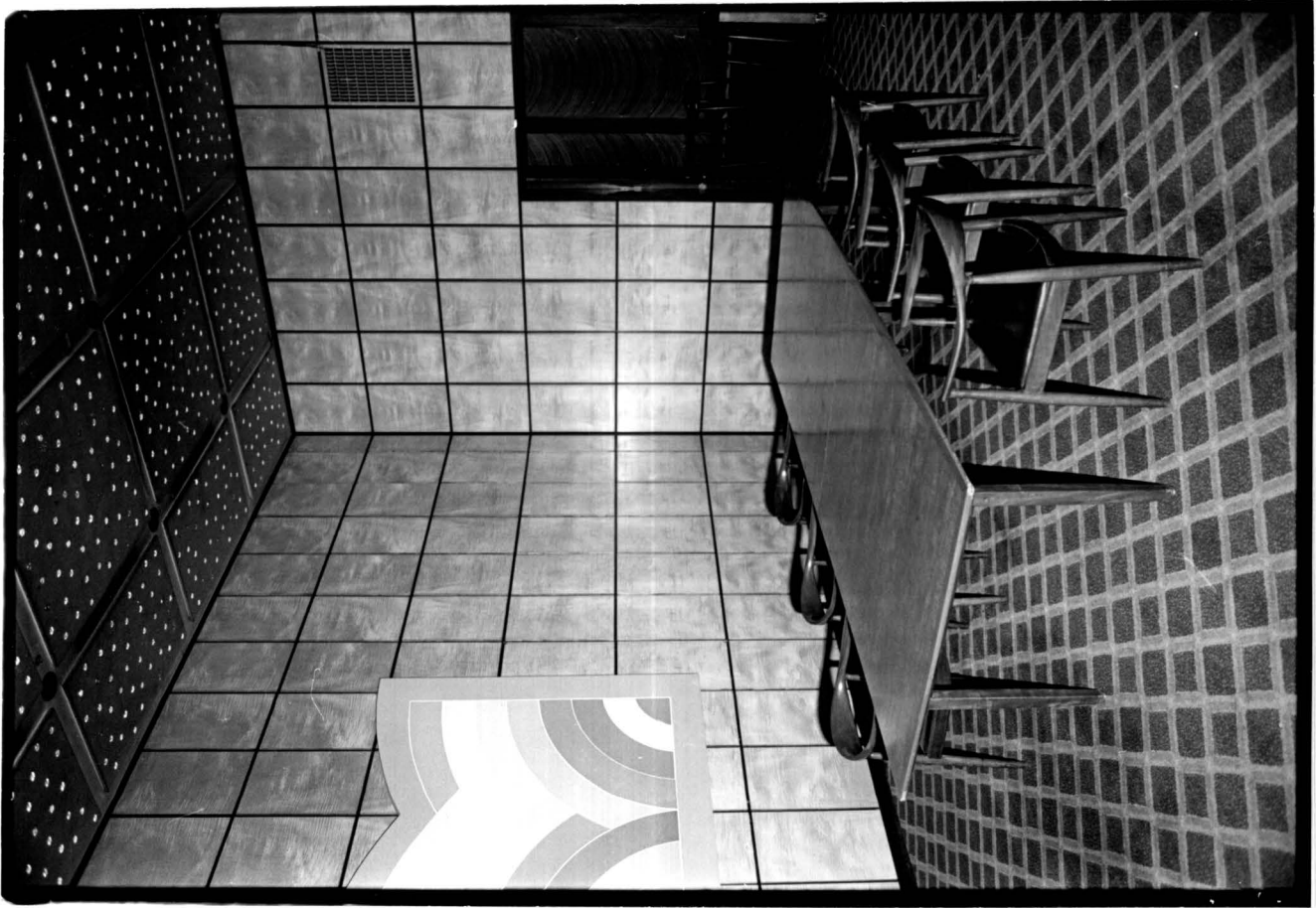
FOUR SEASONS RESTAURANT Private Dining Room FIRST FLOOR INTERIOR