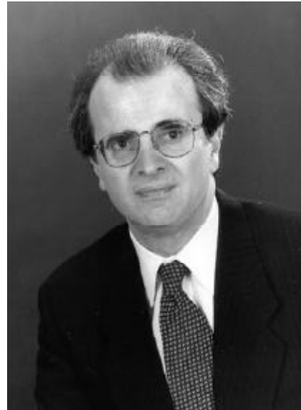
The Derek Photographers Group

I also want to take this opportunity to gratefully acknowledge the assistance and cooperation extended to the Office of Court Administration and to me during 1998 by the Governor and his staff, members of the Legislature, bar associations and individual lawyers and laypersons.