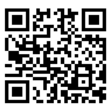
[ SCAN QR CODE ]