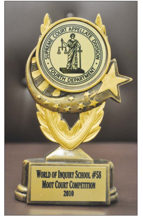
The award presented to the 11 participants in the 2010 School 58 Moot Court Competition