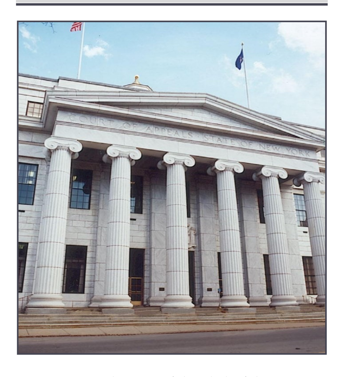
2018 Annual Report of the Clerk of the Court