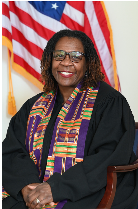
Hon. Edwina G. Richardson-Mendelson Deputy Chief Administrative Judge for Justice Initiatives

The New York State Unified Court System’s Office for Justice Initiatives strives to ensure equal access to justice in all NY State Courts for people of all backgrounds, incomes, and abilities, by using every resource, including pro bono programs, self-help services, and technological tools; and by securing stable and adequate non-profit and government funding for civil and criminal legal services programs.